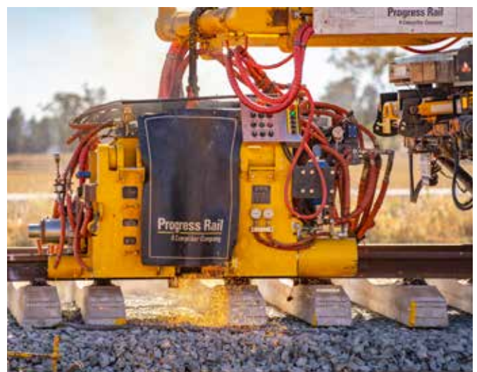
One of 1,200 sections of rail being welded together on Parkes to Narromine.