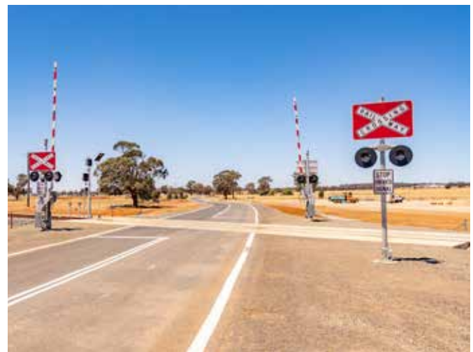
Trains are regularly using this new level crossing on Brolgan Road, Parkes.

Visit inlandrail.com.au/sponsorships to find out more and apply.