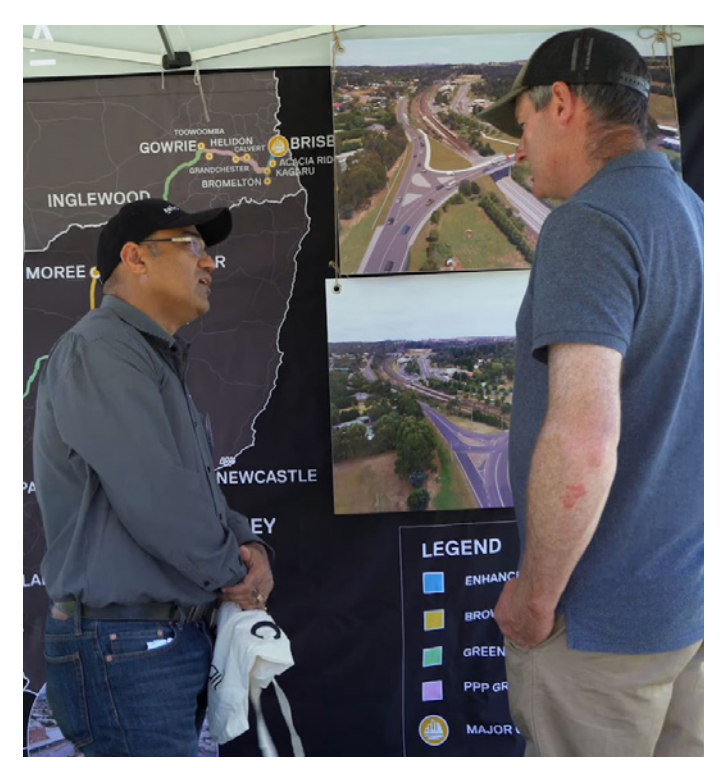
Community consultation at Kilmore Show.

In 2020, we will award construction contracts for these works. Construction is scheduled to start in 2021 once all environmental and planning approvals have been received, and works will be completed by 2025.