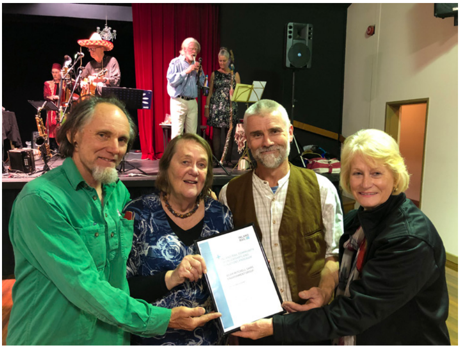
ARTC supported the Mitchell Environment Group (BEAM) to host a Bush Dance commemorating 30 years.

Community organisations can apply for financial grants ranging from $1,000 to $4,000 up to four times a year. Details on how to apply can be found on the Inland Rail website inlandrail.artc.com.au/sponsorships