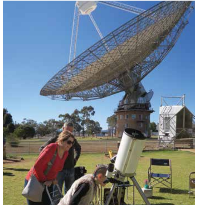
Visitors to the Parkes Radio Telescope viewing the daytime sky at one of the society's Friends of the Dish events.

Their successful application to the latest round of the Inland Rail Community Sponsorships and Donations program will enable the purchase of new broadcasting equipment.