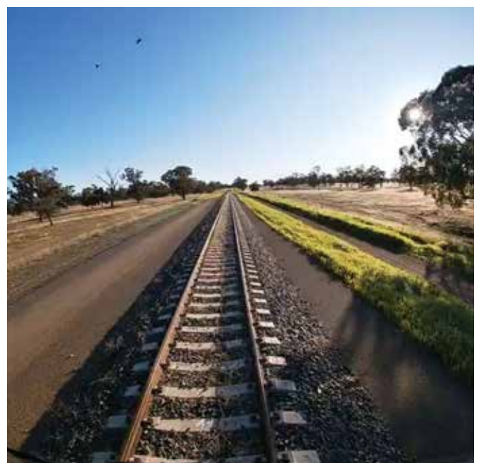
Shot from the new video along the Parkes to Narromine alignment.