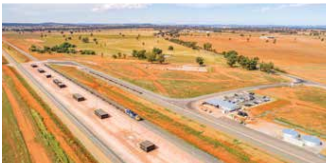
Intermodal hubs along the track will create opportunities.

Inland Rail will better link central NSW businesses, farmers and producers to national and global markets and generate new opportunities for industries and regions, according to a recent EY report.