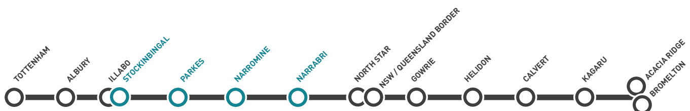
The 13 project sections of Inland Rail's 1700km fast freight backbone

Community consultations, investigations and field studies are continuing and an Environmental Impact Statement is planned to be lodged with the NSW Government for public feedback in December 2020 or January 2021.