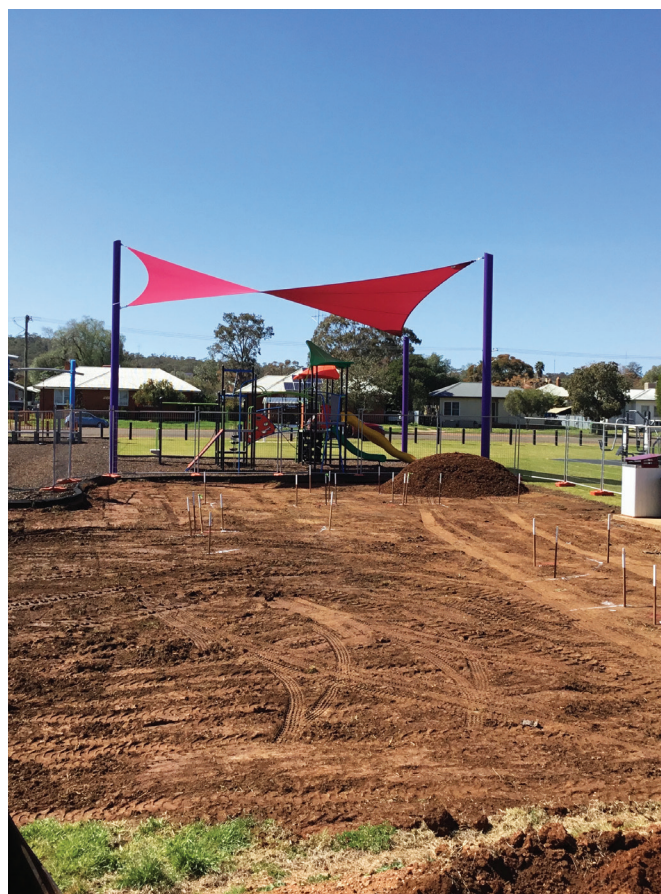
Pushing ahead on the new kids' bike path at Linder Oval, Peak Hill

Works began on this legacy project in late August and are being managed by Parkes Shire Council.