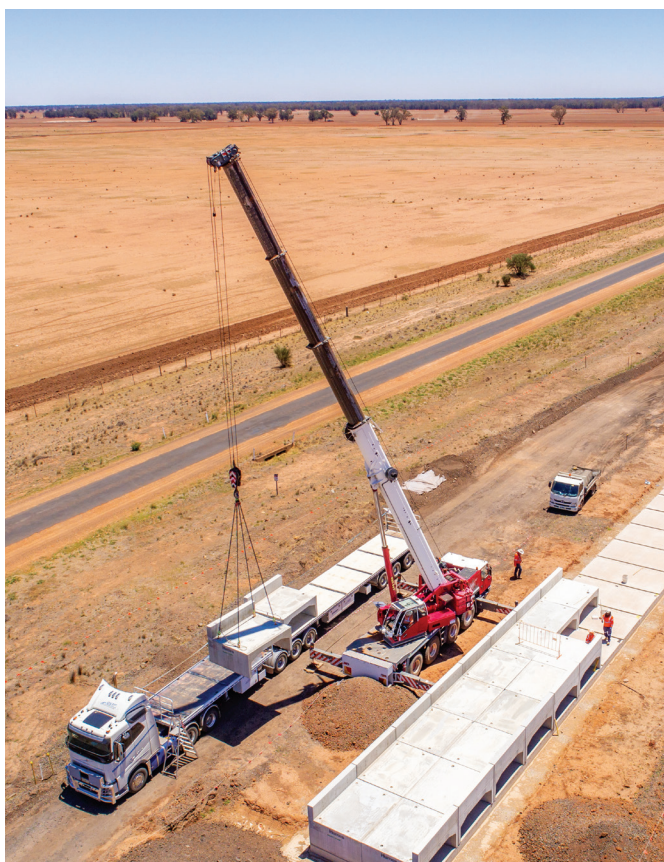
Carbon neutral concrete culverts along the Parkes to Narromine line