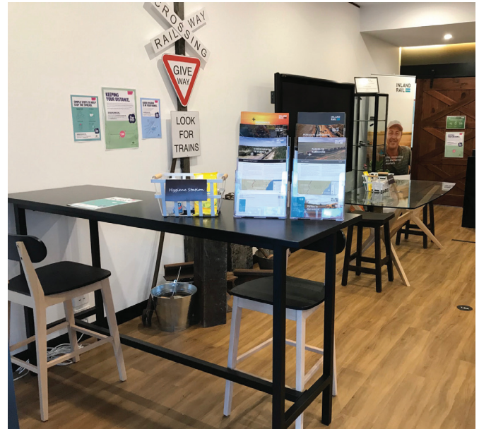
Drop into our Parkes shopfront at 290 Clarinda Street

Call 1800 732 761 or email inlandrailnsw@artc.com.au to arrange a shopfront visit or have your questions answered.