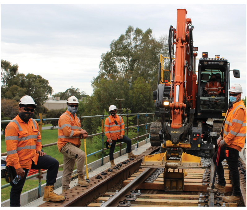
Covid safe working on Mitchell Street rail bridge upgrade in Benalla

Despite the challenging circumstances everyone has faced this year, both progress on the North East Rail Line Upgrade and design planning for Inland Rail in Victoria have continued to forge ahead.