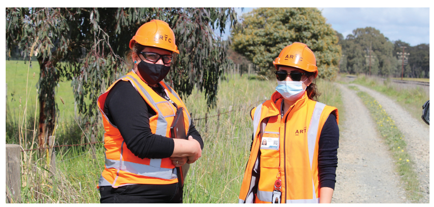
ARTC Environment team out assessing project sites

Following constructive collaboration with the Euroa Working Group, a proposed track re-alignment at Euroa Station has been included in the project's finalised delivery strategy, which will inform the Early Contract Involvement (ECI) process to refine designs for Euroa in 2021.