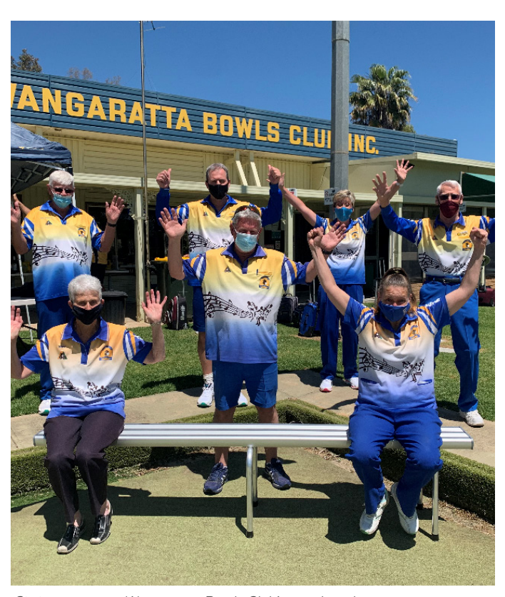
Sitting pretty on Wangaratta Bowls Club's new benches

To find out how your community group may benefit from Inland Rail's Community Donations program, visit our website inlandrail.artc.com.au/opportunities