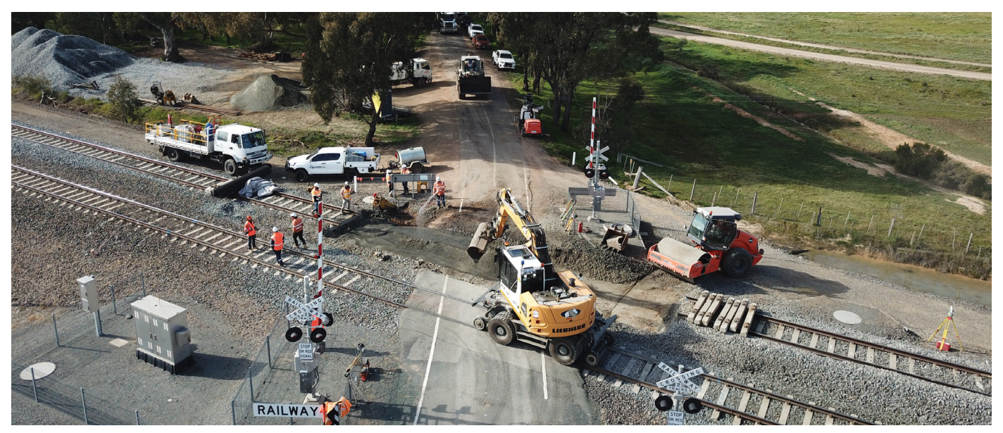
Level crossing renewal at Dudley Road, Euroa