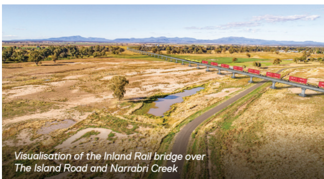
Visualisation of the Inland Rail bridge over The Island Road and Narrabri Creek

To get a bird's eye view of the Narromine to Narrabri section and see the structures of the current design, go to inlandrail.com.au/n2n-works-planning and watch the fly-throughs.