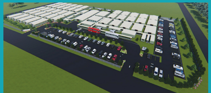
Artist impression – Moree workers' accommodation village

Staff living and working at the village will have access to a dining room and recreational areas. No shops will be located within the facility, demonstrating our commitment to support local businesses. In addition, no alcohol will be supplied at the workers' accommodation.