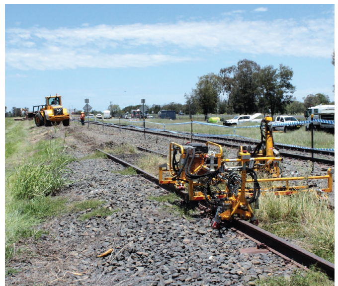
Track removal as part of the track foundation trials at Gurley.

Removing sections of track along the alignment, including the track foundation, and installing new lime-stabilised foundations to ensure track durability.