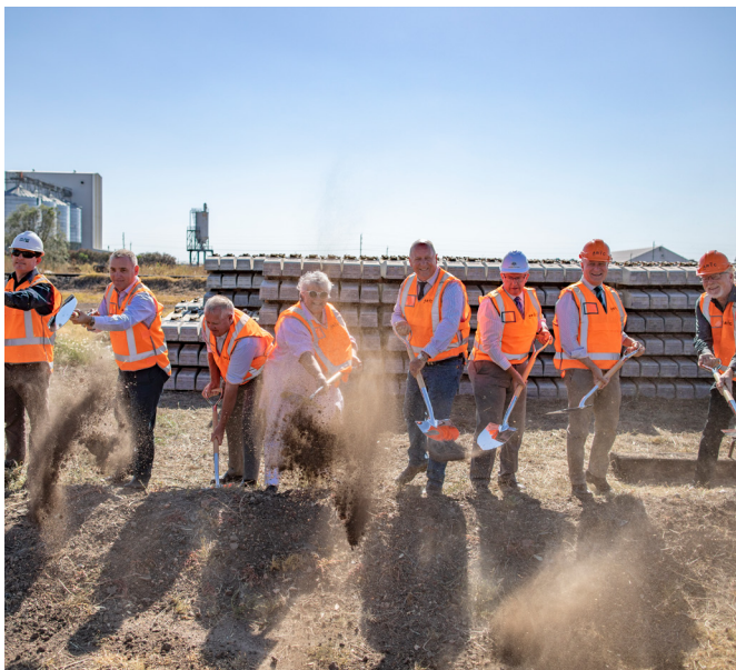
Sod turning event in Moree on 27 November 2020

In this and future newsletters, we will keep you informed of current and upcoming works, introduce key members of the Trans4m Rail team and explain how construction impacts are being mitigated and rail safety is being managed during construction.