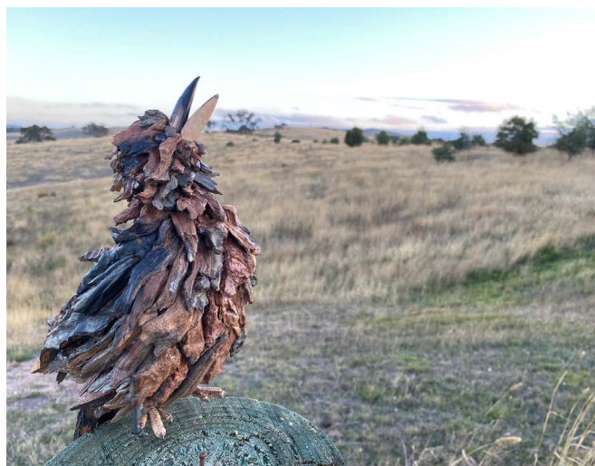
Sculpture featured at the Kilmore Art Expo

"Sculptural art matches perfectly with the type of work Inland Rail is doing and we're very pleased to have finally been able to open this new exhibition, after cancelling the show due to COVID-19 restrictions last year," Andrea said.