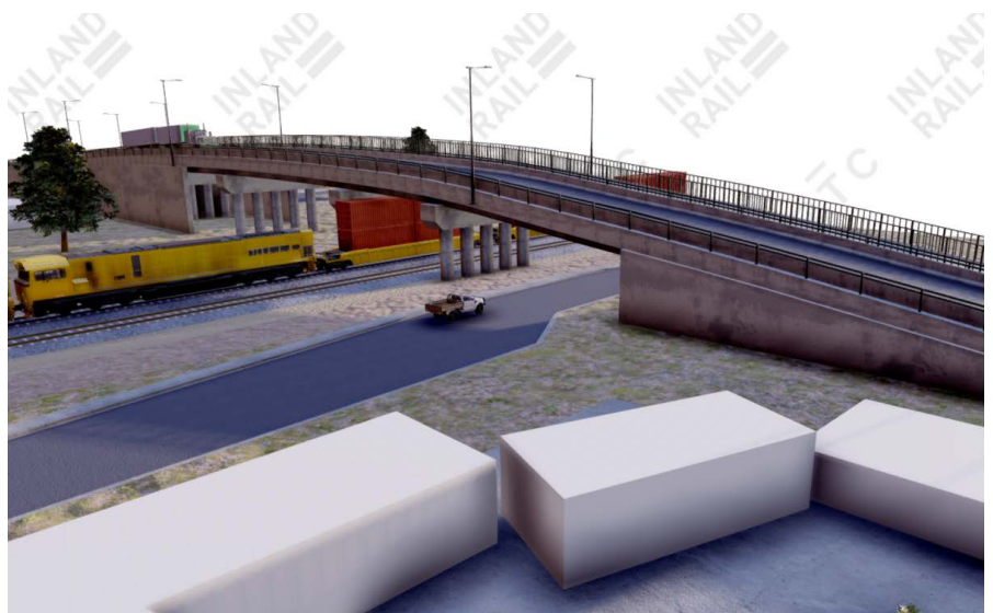
Visualisation of proposed new Beaconsfield Parade bridge at Glenrowan

This proposed design will be included in the project's Heritage Permit application for the Glenrowan Heritage Precinct. Heritage Victoria will be seeking community feedback on our application in the coming weeks, and we'll share more details soon.