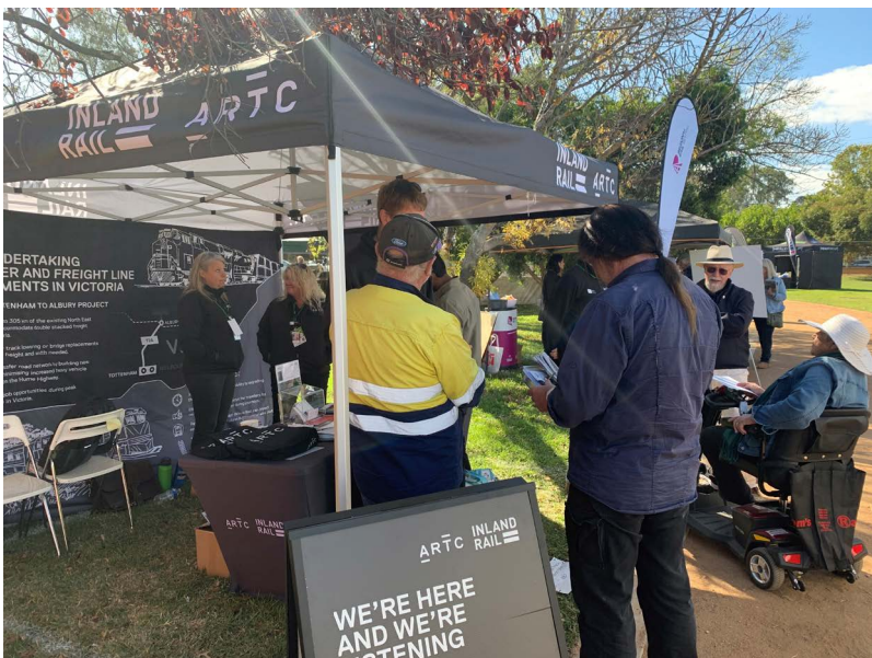
Seymour Alternative Farming Expo

Our next rounds of engagement will focus on heritage permits for Glenrowan and Wangaratta, and after that we'll be seeking community feedback on our Environment Report.