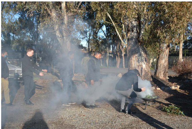
Inland Rail Tottenham to Albury project team participating in a smoking ceremony in Seymour