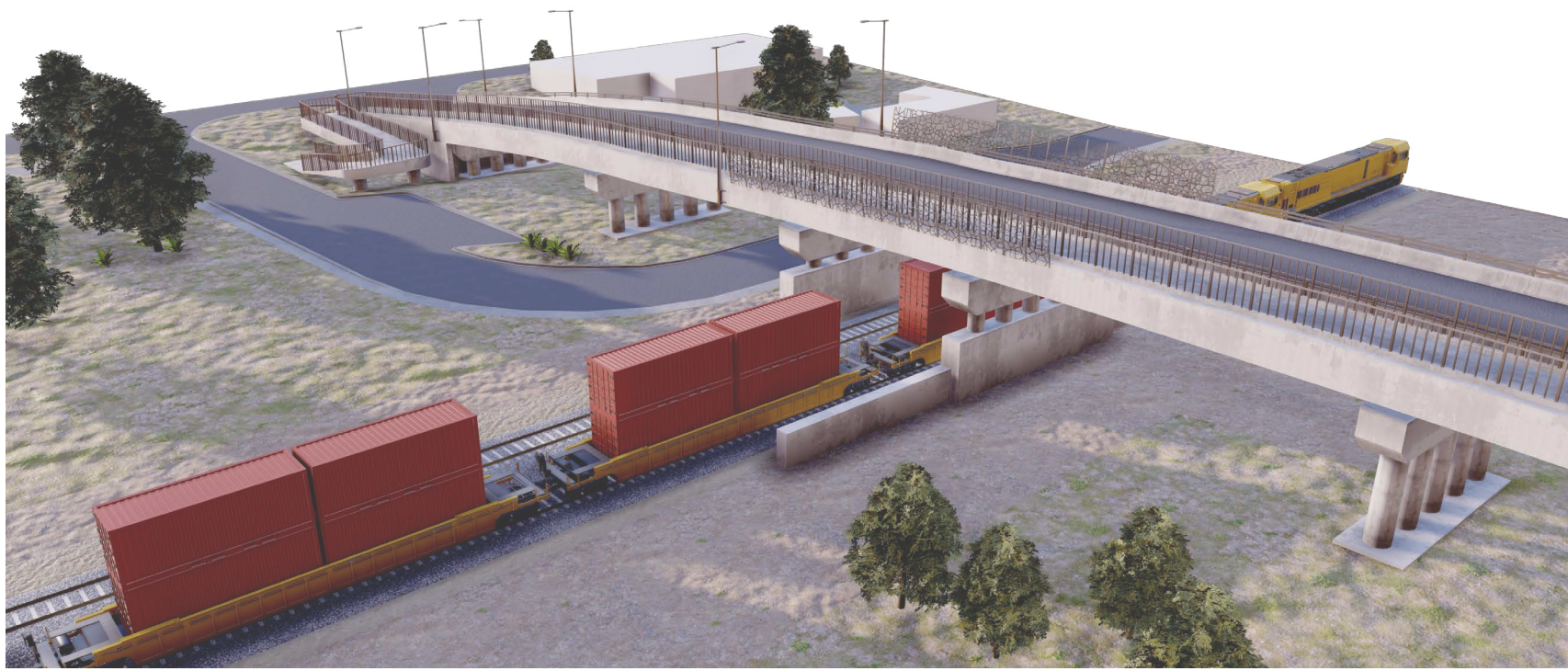
Visualisation of proposed Beaconsfield Parade Bridge, Glenrowan