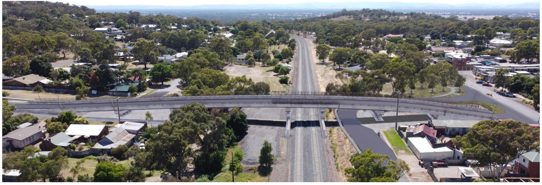
Visualisation of proposed Beaconsfield Parade Bridge, Glenrowan

ARTC is committed to working with communities and and local government as a vital part of our planning and consultation work, and we value your any questions or comments, please let us know.