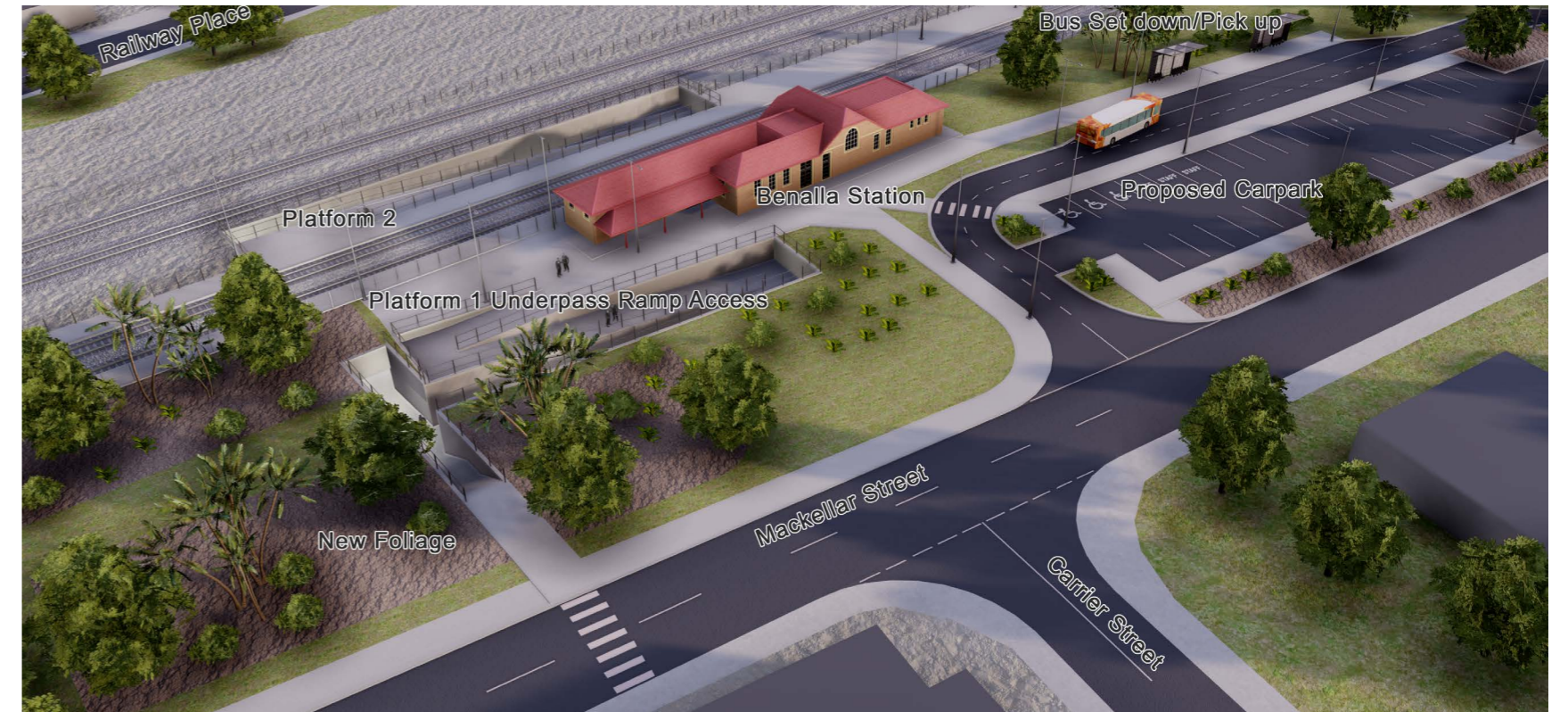
Visualisation of what a track realignment with a pedestrian underpass may look like at the Benalla Station Precinct