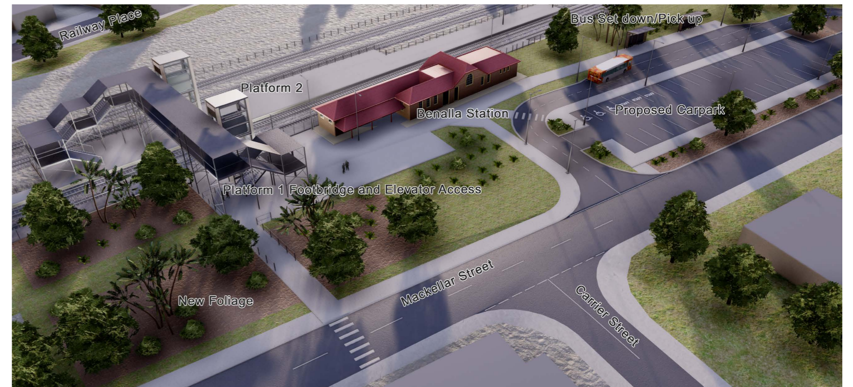
Visualisation of what a track realignment with a pedestrian overpass may look like at the Benalla Station Precinct