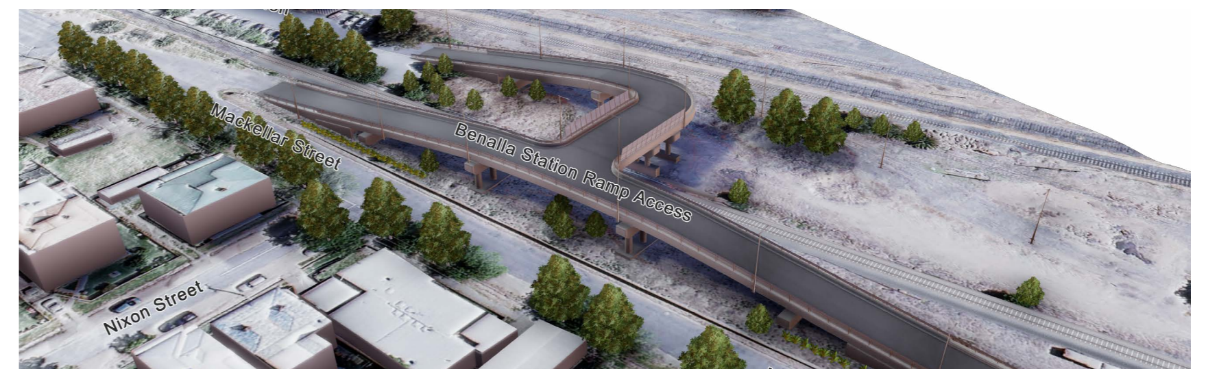
Visualisation of what a new bridge may look like to replace the existing structure for Benalla Station Approach Road