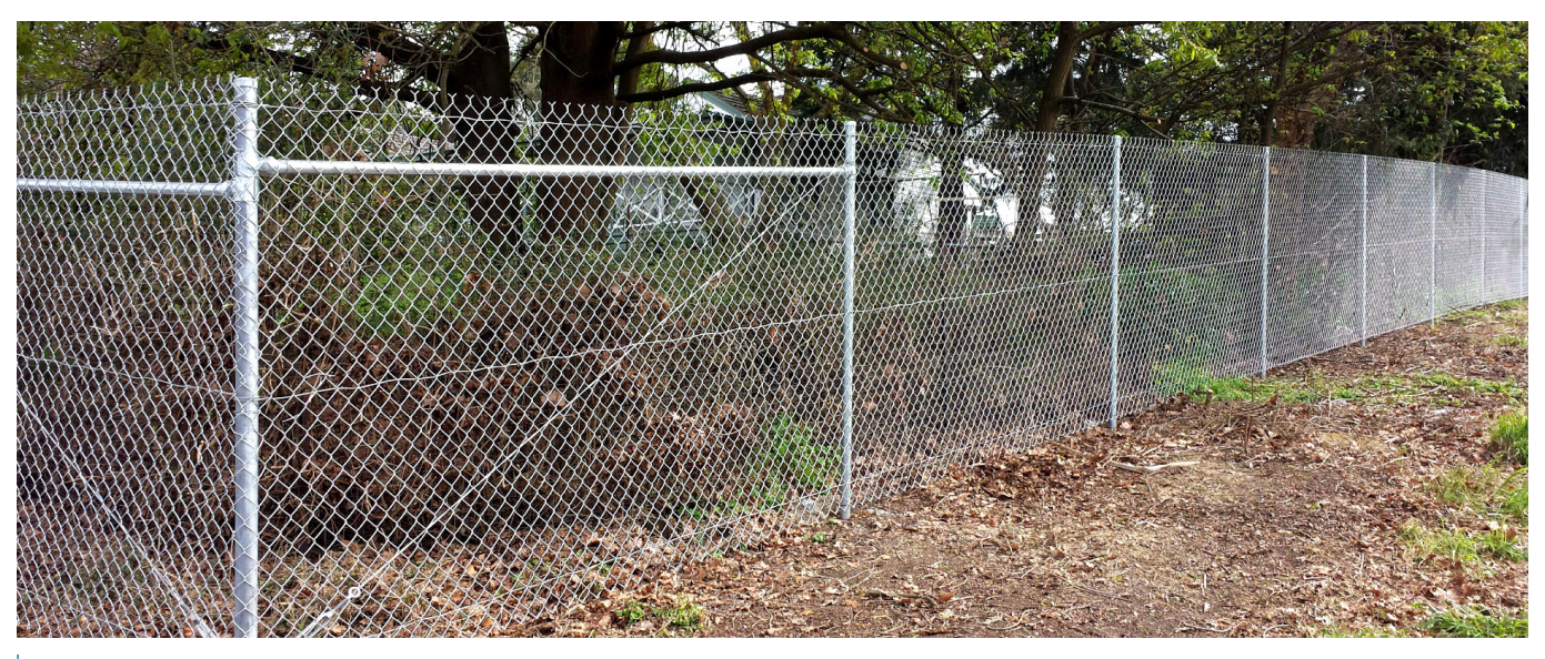
3 Urban fencing