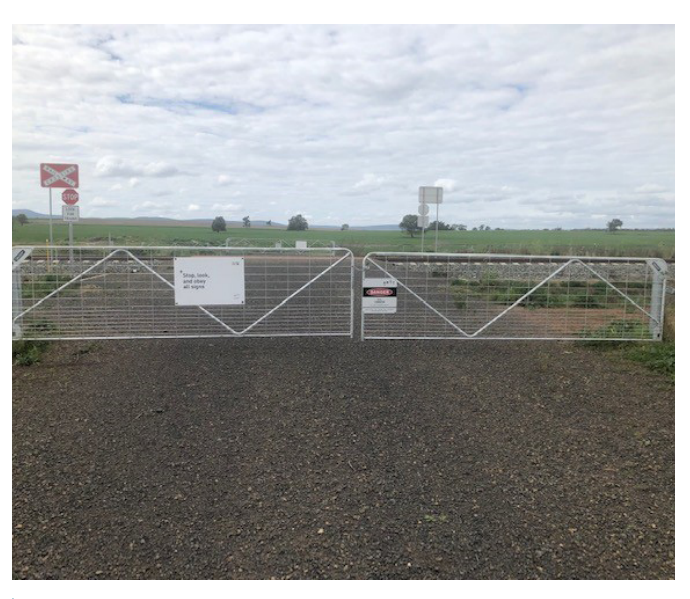
Private gate image is for reference purposes only. Subject to detailed design.