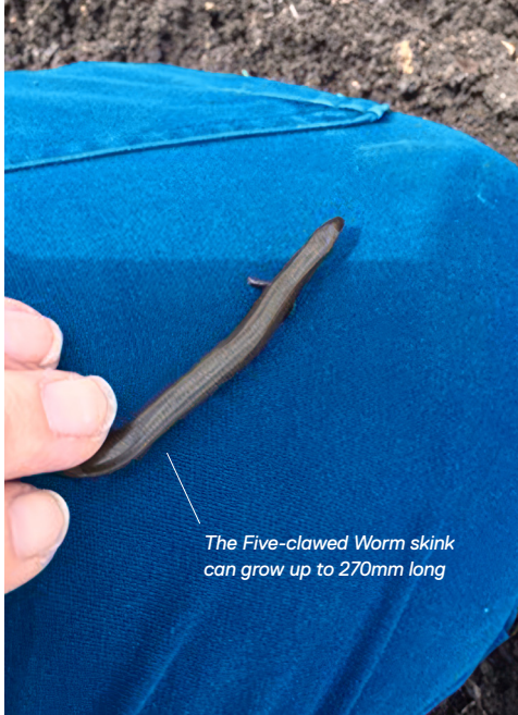
The Five-clawed Worm skink can grow up to 270mm long

To learn more about the threatened Five-clawed Worm skink, visit the NSW Government's Office of Environment and Heritage website at inlandrail.info/3mlqGtn