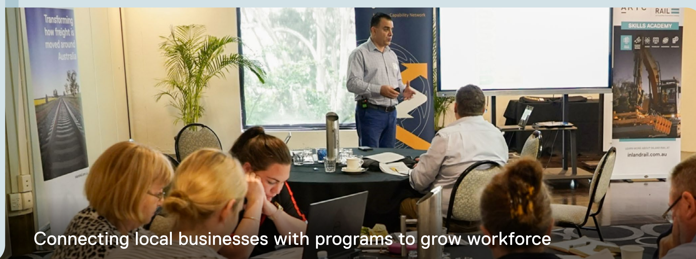
Connecting local businesses with programs to grow workforce