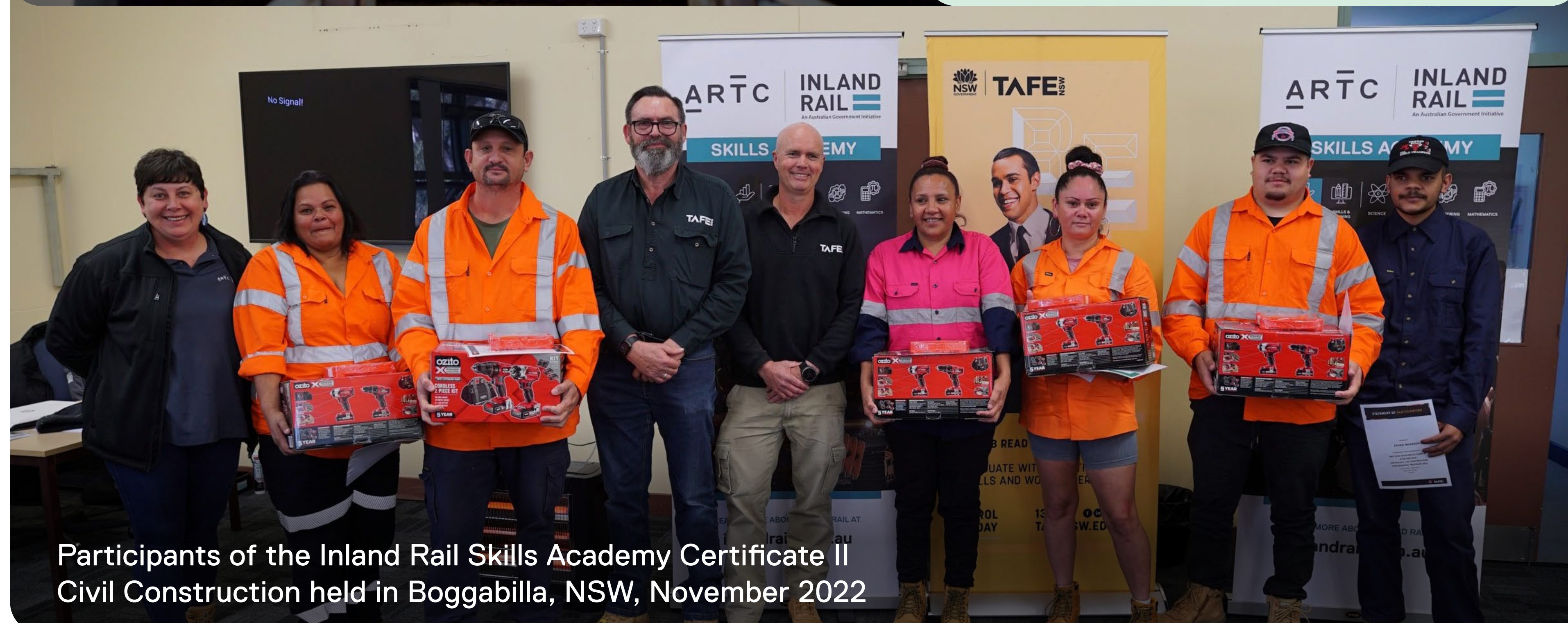
Participants of the Inland Rail Skills Academy Certificate II Civil Construction held in Boggabilla, NSW, November 2022

students engaged in STEM activities which aim to raise awareness of the types of careers required to build a major project like Inland Rail