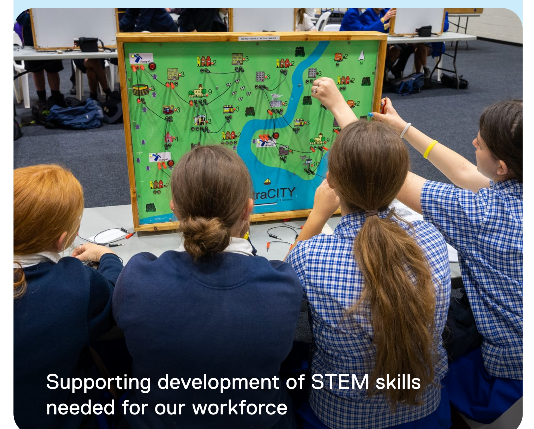
Supporting development of STEM skills needed for our workforce