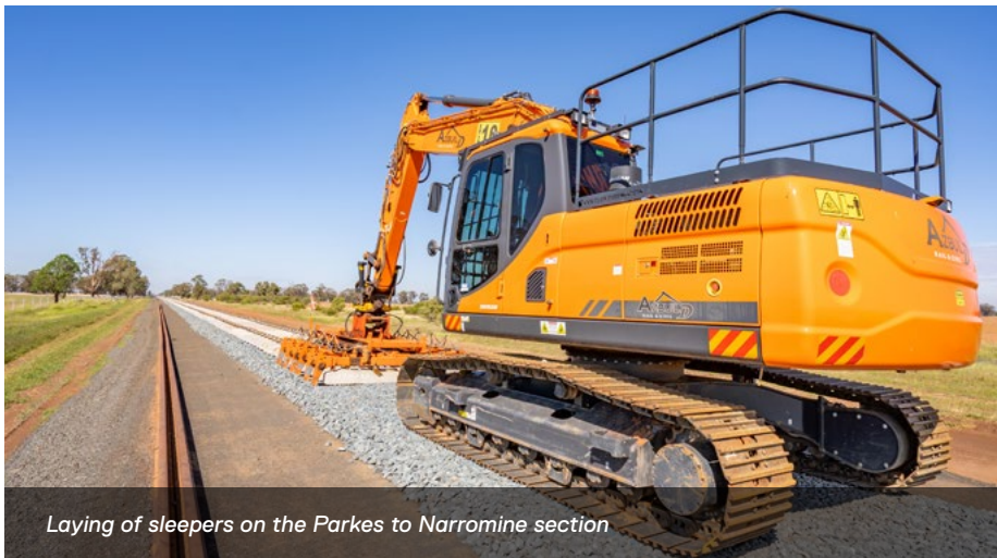
Laying of sleepers on the Parkes to Narromine section