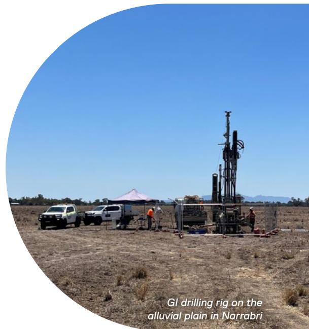
GI drilling rig on the alluvial plain in Narrabri

Want to know more? We are committed to working with property owners, communities, state and local governments as a vital part of our planning and consultation work, and we value your input. If you have any questions or comments, please let us know.