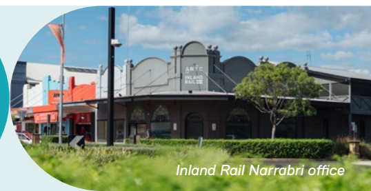
Inland Rail Narrabri office

We're now in the final stages of our Australian Government approvals pathway. We've responded to requests for additional information and discussed draft conditions of approval with the Department of Climate Change, Energy, the Environment and Water (DCCEEW). A decision from DCCEEW is expected in early 2024.